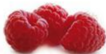
3. fruits rouges