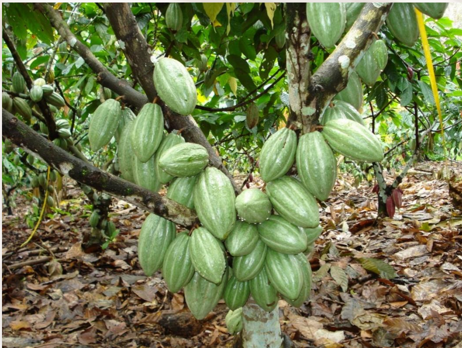
Variety Almada (FA 13)