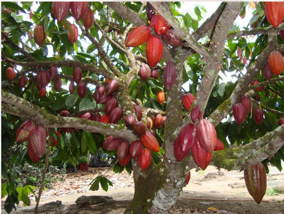
Variety Encantada (PS 13.19)