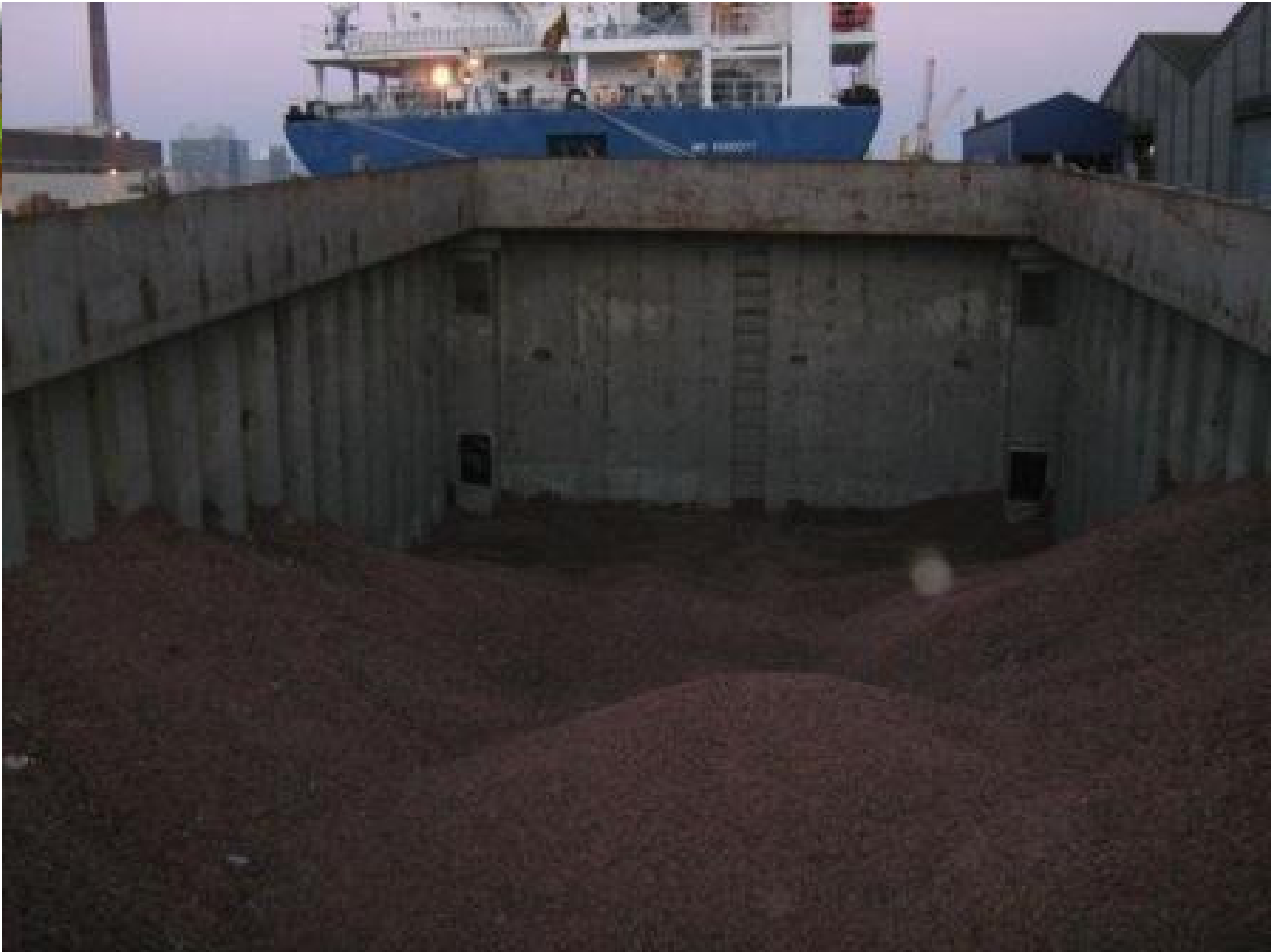
Mega-bulk being discharged