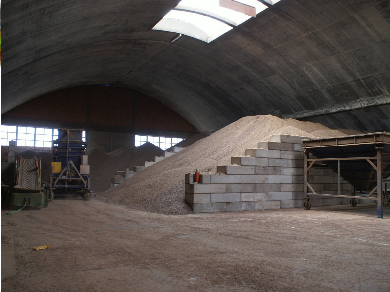
1,000 tonne Bulk Delivery Unit – smallest sized bulk parcel