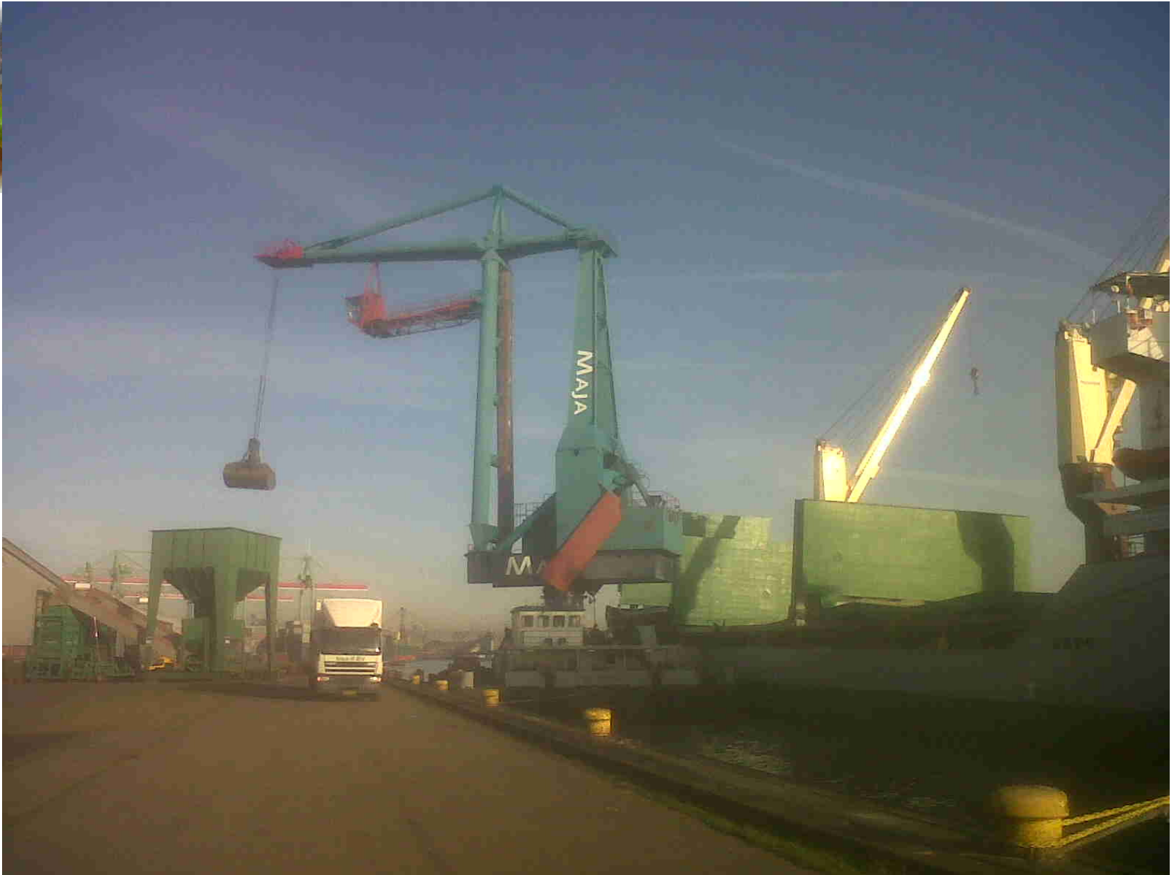
Mega-bulk being discharged – into weighing hopper and sampler