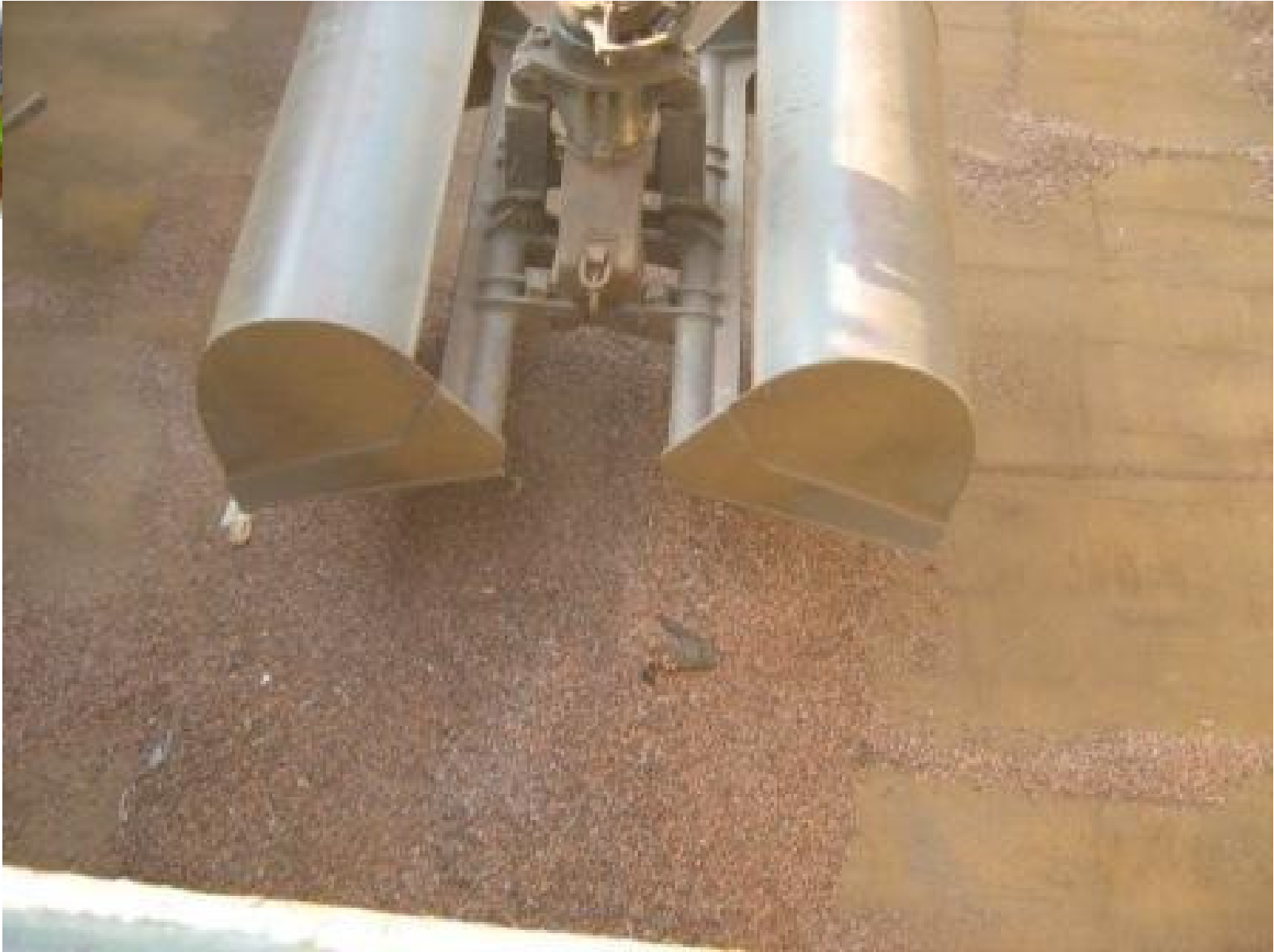
Mega-bulk being discharged – by grab